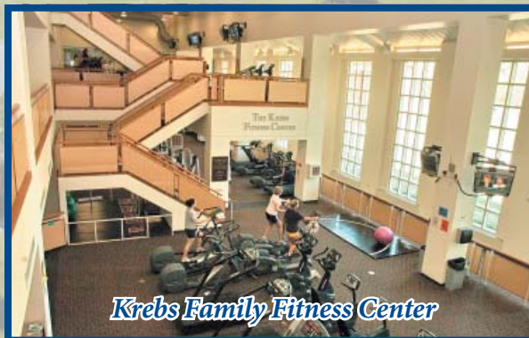
Krebs Family Fitness Center